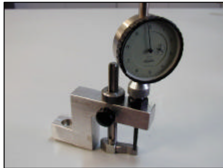
DETROIT DIESEL PUMP-INJECTOR KIT , 5236991 TYPE