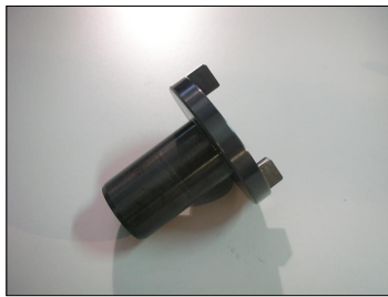
Coupling Ø35 P.N.: 555-CP9-V2