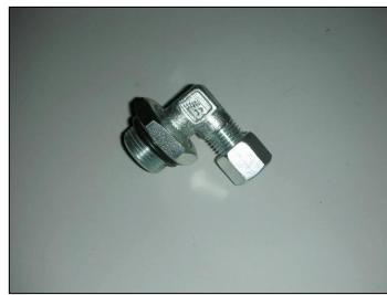
Pump delivery connection 22x1,5 P.N.: 555-CP9-V7