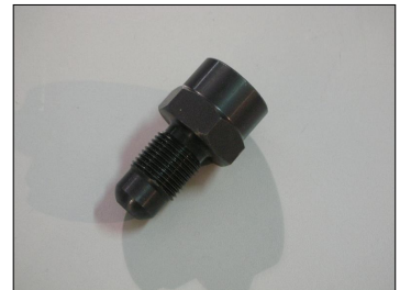
Ogiva connection P.N.: 555-6-1