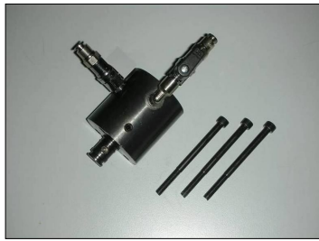
Regulator adapter P.N.: 555-CP9-V5