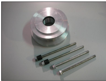
Flange P.N.: 555-CP9-V1