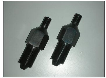
High pressure outlet connections P.N.: 555-CP9-V4