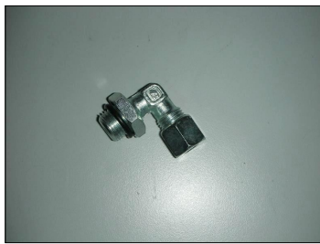
16x1,5 Pump return connection P.N.: 555-CP9-V6