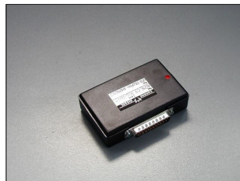
Delphi - Siemens - CP3 Software P.N.: ACME07