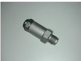
Overpressure valve-Bosch type 1 110 010 035