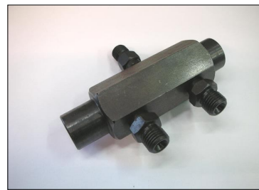
CP2 Rail P.N.: 555-41-3