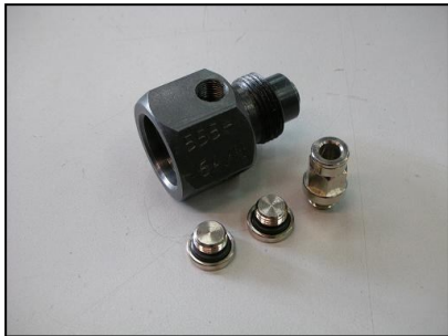
High pressure adapter for delivery detection from PVC P.N.: 555-6A/N