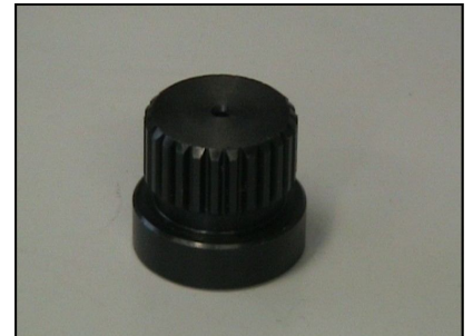
Coupling P.N.: 555-14N