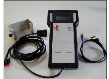
Regulator tester P.N.: 555-41-2