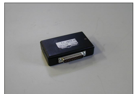
CP3-Siemens - Delphi software P.N.: ACME07