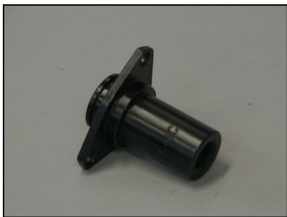
Transfer pressure connection P.N.: 555-6C