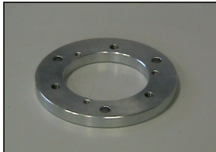
Mercedes Flange* P.N.: 555-11