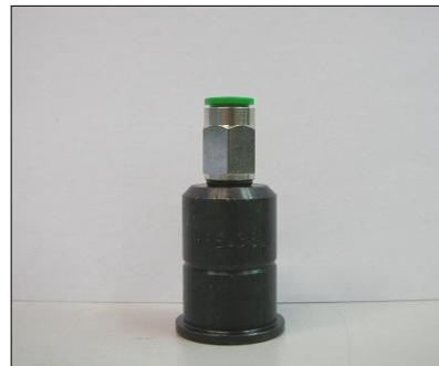
Injector Union P.N.: 555-38-1

* N.B.: The ones who own the old Cam-Box P.N.555-24/ISO have to be supplied with the cover P.N.555-29-2 and the tappet screw P.N. 555-38-2