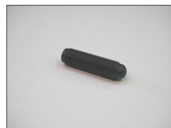
Tappet Screw P.N.: 555-38-2