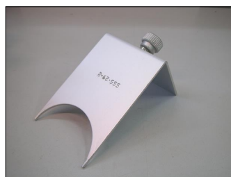
Cover P.N.: 555-29-2